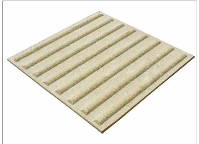
Corduroy Tactile Plate.

A fitting service available if required.