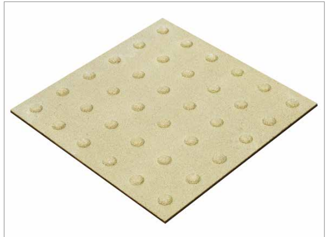
Blister On-Street Tactile Plate.